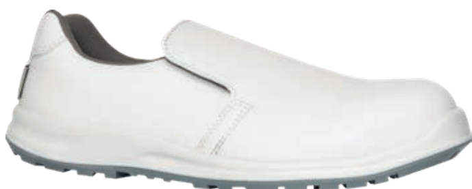
□ 9897 WHITE | 36 ▶ 47