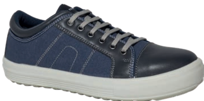
■ 7822 BLUE | 36 ▶ 48