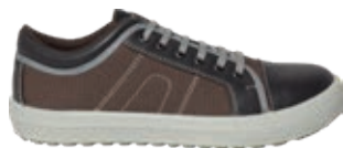
■ 7825 BROWN