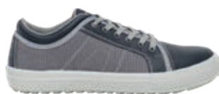
■ 7850 GREY