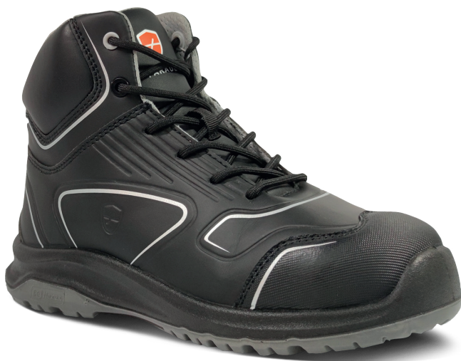
■ 8844 BLACK | 35 ▶ 48